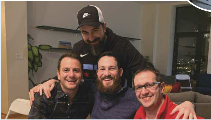
Reshet Ramah , the alumni network of the Ramah Camping Movement, sponsored a young alumni Hanukkah party at Base Hillel in the Loop and oMOMnut, a Ramah Moms night of crafts in Highland Park, Illinois.