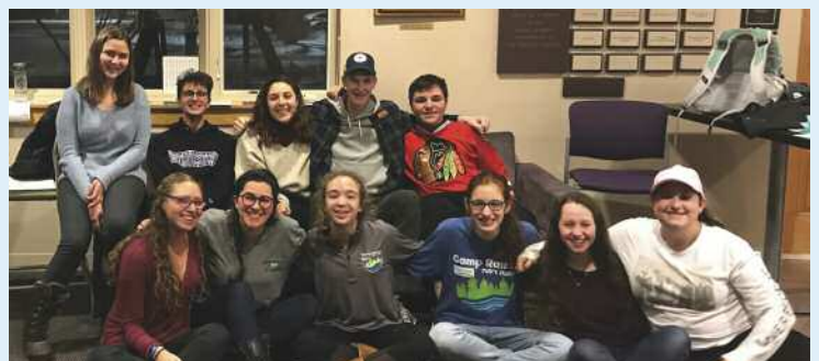
Our 2019 cohort of Amitei Ramah Teen Fellows participated in leadership training and community service opportunities