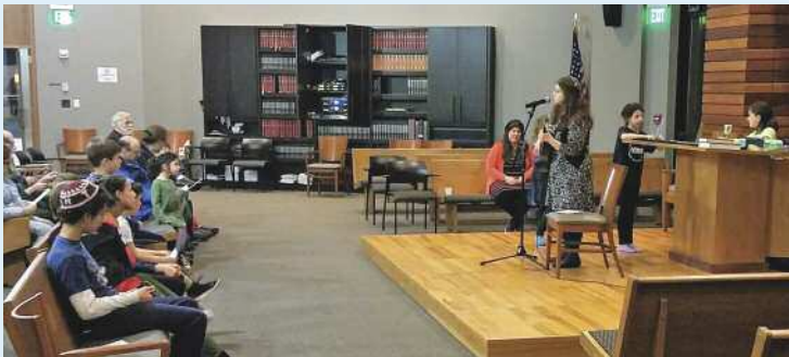
Campers and their families had a great time at the Des Moines Shabbaton in February