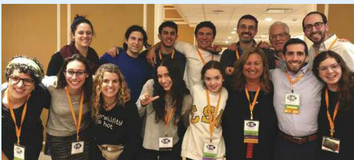
The Ramah Wisconsin delegation joined educators, songleaders and clergy for the energizing Songleader Boot Camp 2019 in St. Louis in February