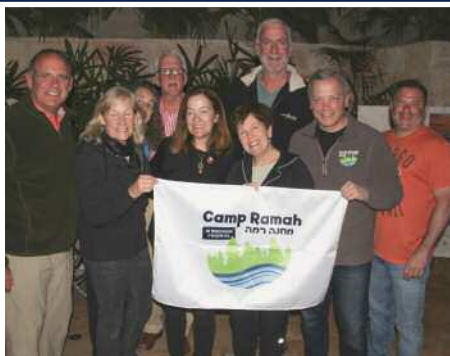
Wisconsin Ramahniks on the 2019 Ramah Israel Bike Ride & Hike