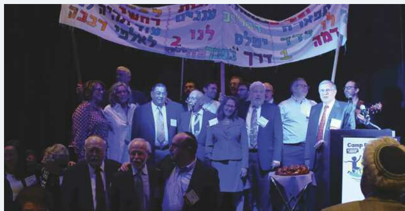
The evening ended with Himnon Ramah, the camp song

Check out our website at www.ramahwisconsin.com to follow our blog, youtube channel and alumni updates and stay connected using the subscription center embedded in the footer of the home page.