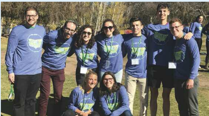
Ramah Wisconsin representatives enjoyed the Weinstein Institute , the National Ramah Leadership Institute held in January in Ojai, California